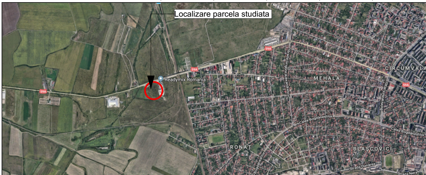
Incadrare in localitate

mun. Timisoara, jud. Timis, str. Lt. Ovidiu Balea, nr.147, CF 434095, CF 438630, CF 438631, CF 438632, CF 438633, CF 438573