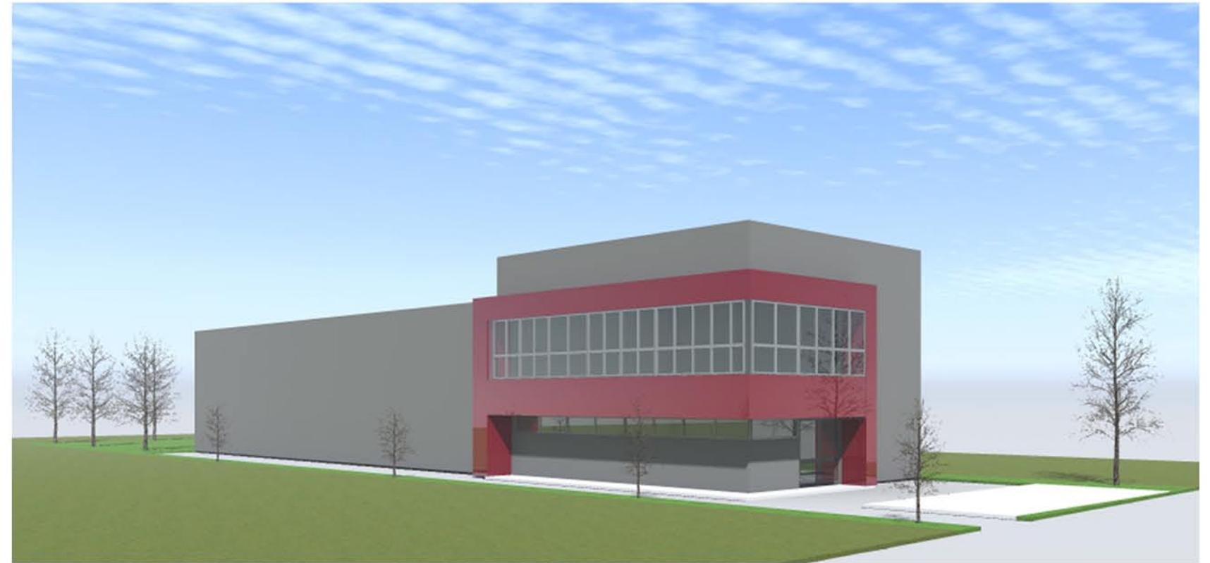
PERSPECTIVA ZONA ACCES