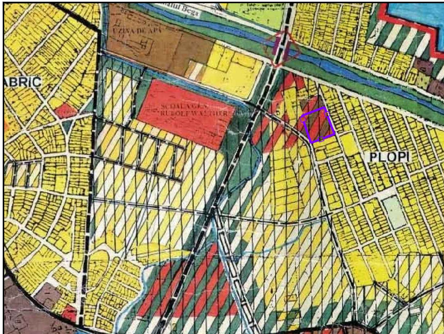
INCADRARE IN P.U.G.