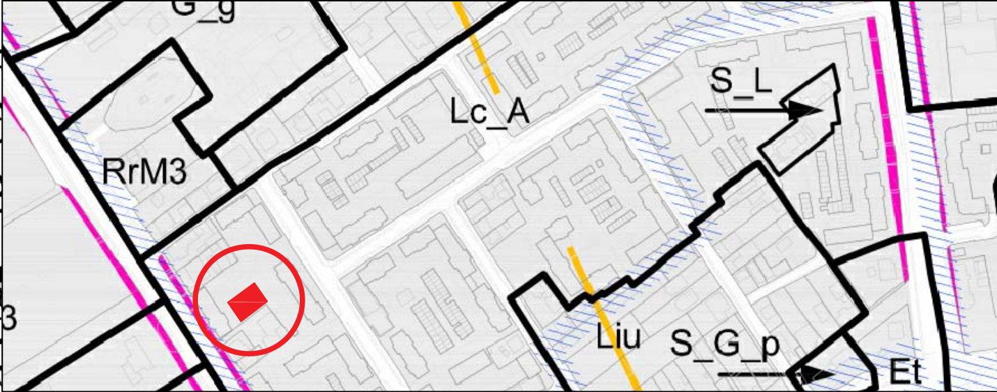
INCADRARE CONFORM PUG NOU