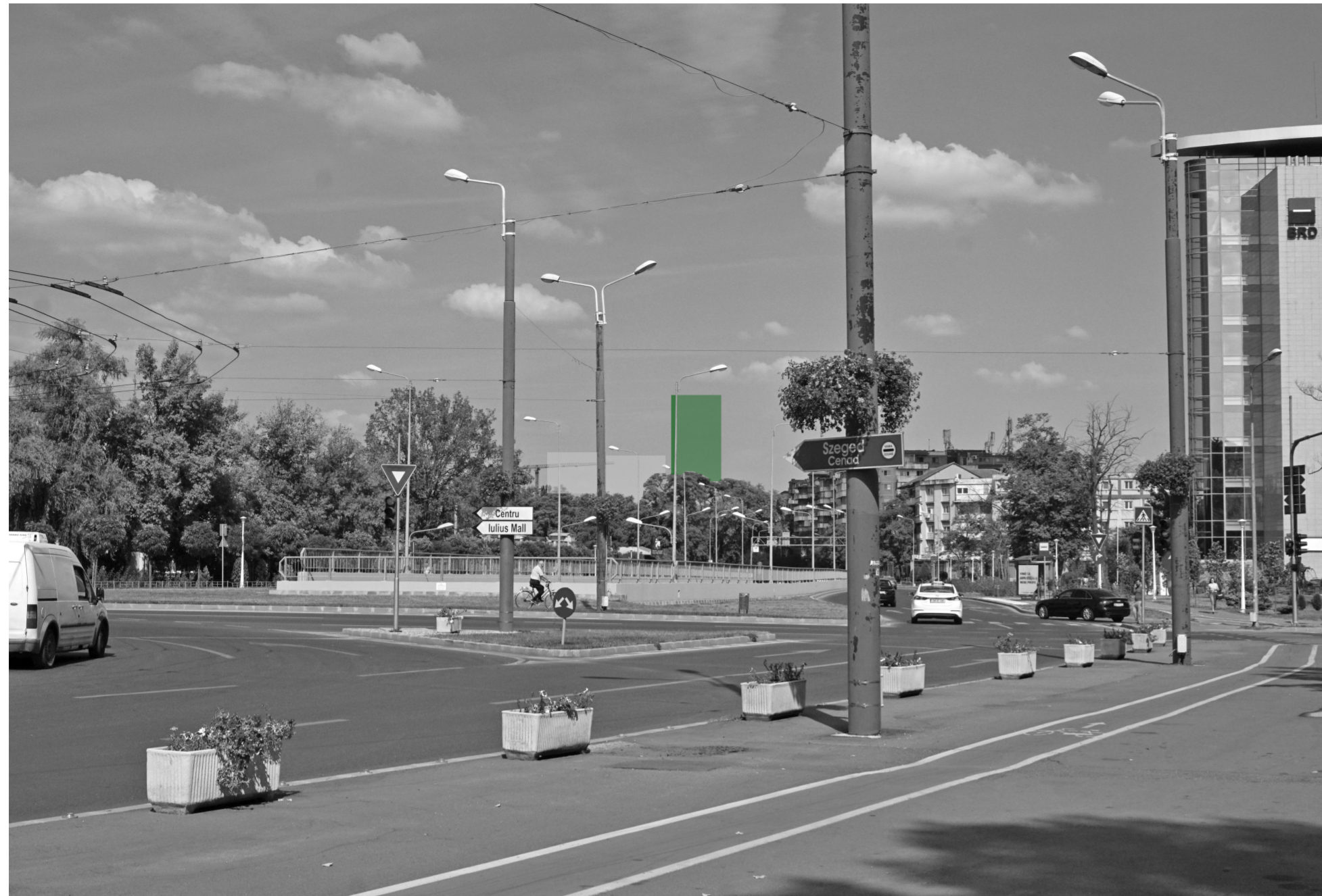
1 - PASAJ MICHELANGELO