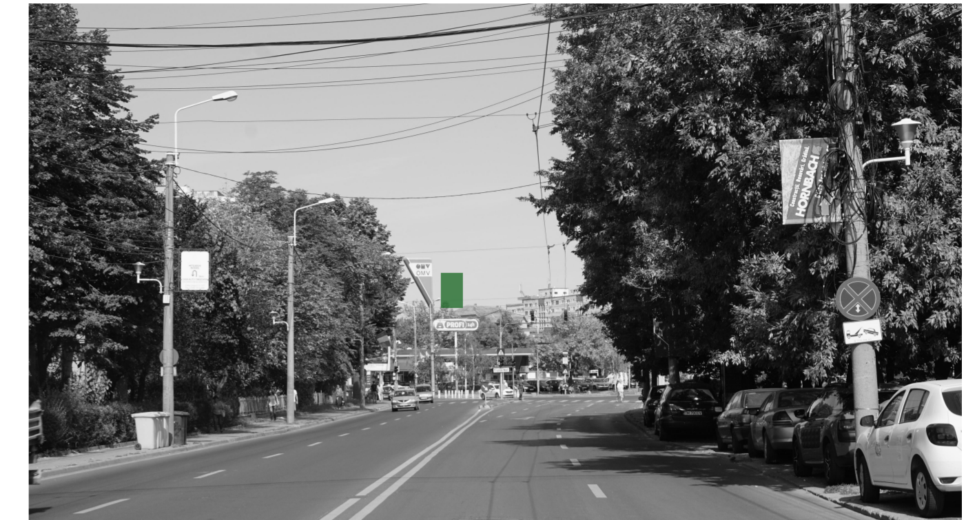
3 - STR. ARIES