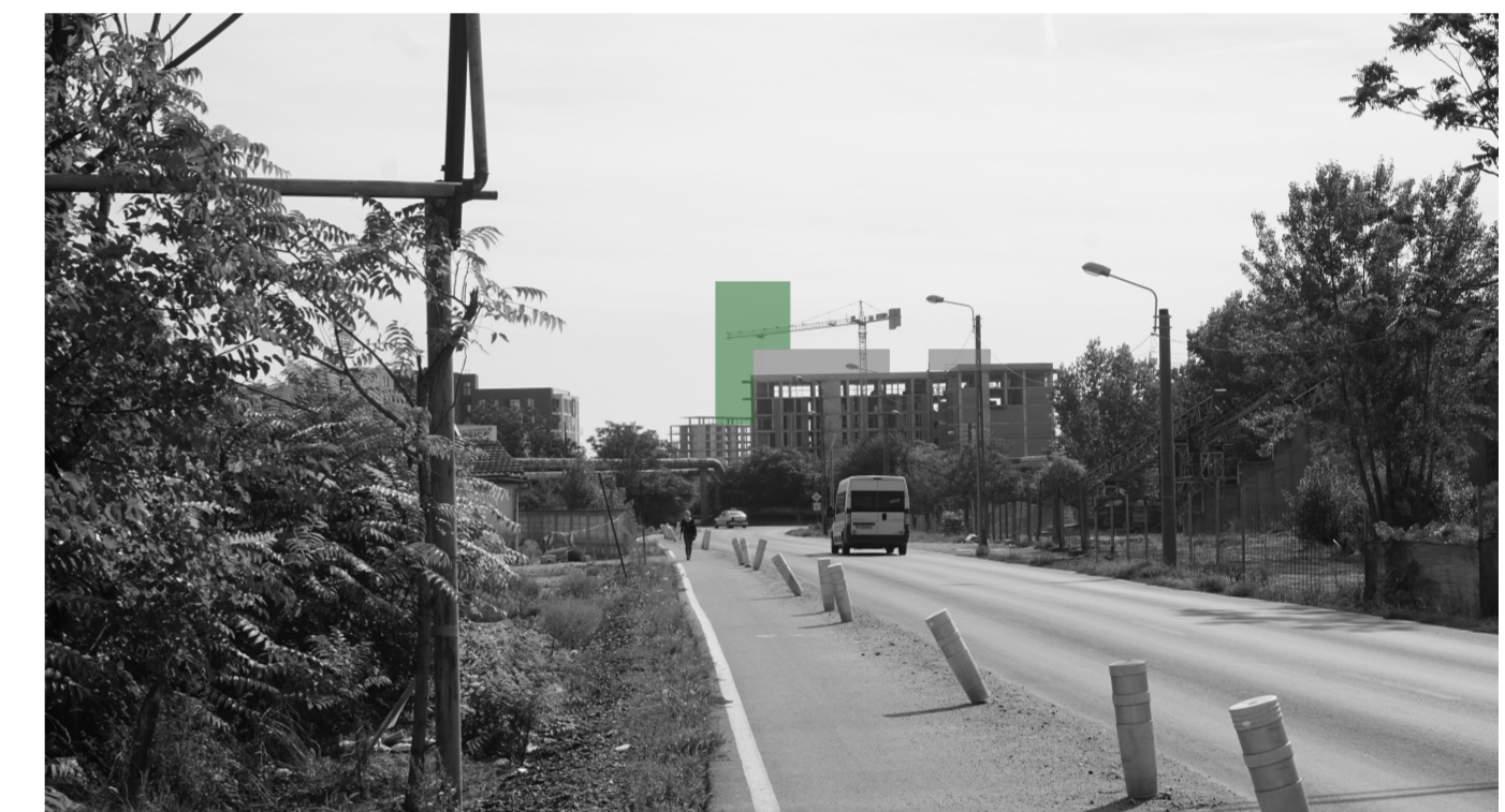
4 - INELUL 2, ZONA IULIUS MALL