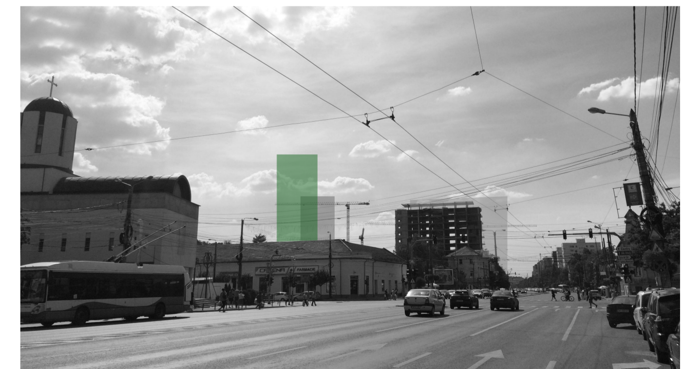
5 - PIATA BADEA CARTAN